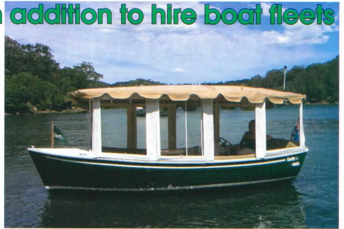
The Duffy 16 Classic.

Eco Boats represents both imported and locally built electric boat brands such as the Duffy Electric Boat Co from California, but also drive systems, such as Torqeedo electric outboard motors.