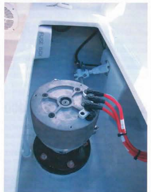
The eco-friendly, quiet, and efficient electric motor.

"Electric boats are the perfect addition to an